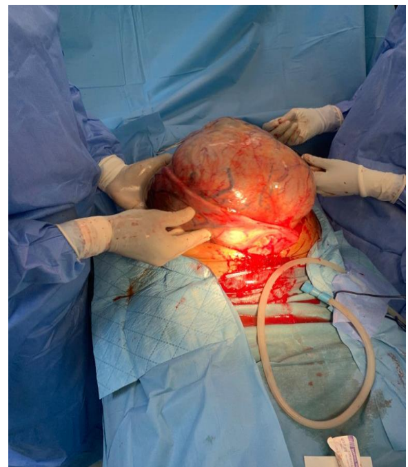
Intraoperative cyst image