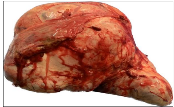
Image of the cyst after surgery