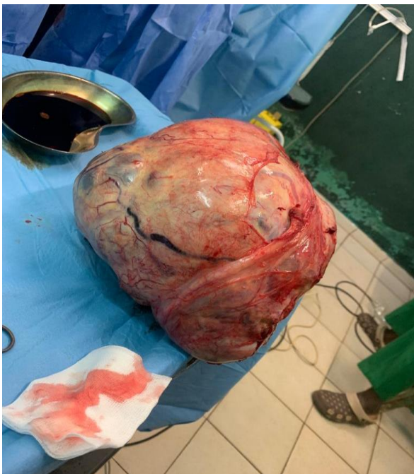
Image of the cyst after surgery