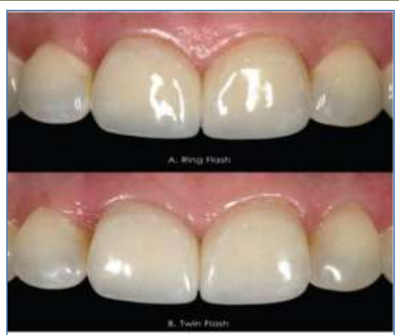
Figure 5. Note the lack of shadow and plasticity of the ring flash photo (top). The twin flash photo (bottom) shows soft, uniform illumination that reveals surface detail and color transitions.