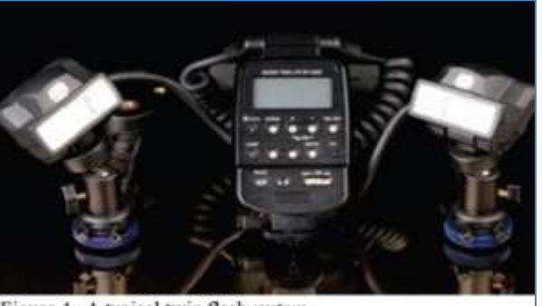
Figure 4. A typical twin flash system

While requiring more experience and thought for proper use, the twin flash design system may offer the best combination of soft, uniform illumination because it simultaneously reveals surface detail, color transitions, translucency variations, and crack lines (Figure 5).