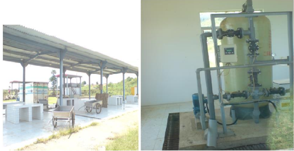
Picture set 1: Wakawaka landing site-features as presented by Guloba. Picture set 2: Wakawaka landing site-features as presented by Guloba.