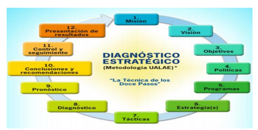
Figure-1. 12 step technique. Academic source: Aguilar & De la Maza (2002).

It is important to consider that in the strategic field it is important to consider the following elements for a strategic diagnosis.