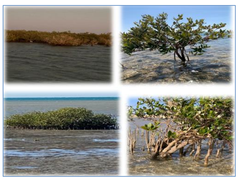
Fig-2: Different isolation sites from thuwal, Farasan and Jazan region