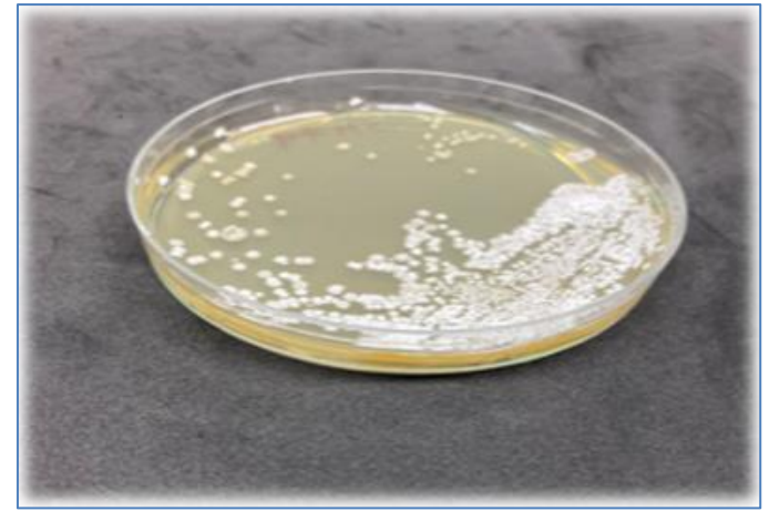
Fig-4: De-replication of isolate SH88J