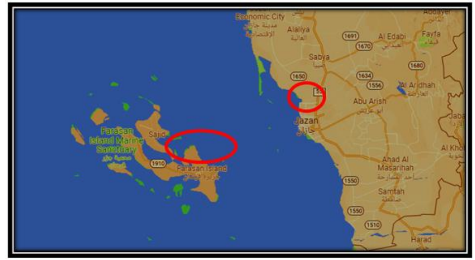
Fig-1: Geographic map showing location of samples collection Saudi Arabia using Google earth software.