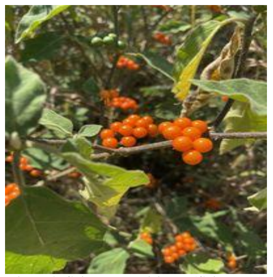
Figure 1: Solanum anguivi Lam (Solanaceae)