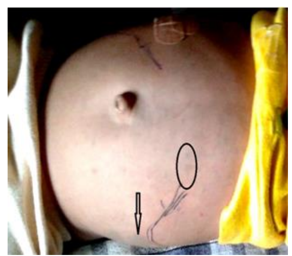
Fig. 1: Multiple Mongolian spots with hepatosplenomegaly

ophthalmic examination there were multiple cherry red spots in the fundus.On investigating the case there was Hb-9.9gm% TLC was 15,200/mm³ ( N 38,L 57, E 03, M 02)TPC was 4.5 lac. Reticulocyte count was 0.5%. ps showed normocytic normochromic anemia. PT INR was normal. Total bilirubin was 0.7mg/dl, direct fraction was 0.4mg/dl, SGOT-635 IU/L, SGPT-406 IU/dl, sr.alp-538, sr.protein-6gm%, sr albumin-4gm%, HBsAg was negative. X-ray imaging of chest and spine were normal. ICTC was non reactive. Sickling test was negative. Hb electrophoresis showed AA band. Liver biopsy was done. It showed features of foamy cells with microvacuolated hepatocytes (Fig. 3).