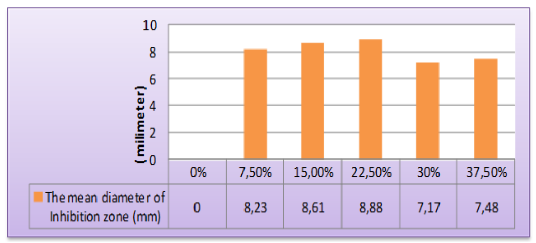
Fig. 1: The Average Results of Measurement of Preventive Zone Diameter (mm) of Sub-Clinical Mastitis-Inducing Bacteria

Result of analysis of variance using output from SPSS shows that treatments have produced insignificant influence (p< 0.05) on bacterial preventive zone. Therefore, bacterial preventive zones are less obviously different because media and incubation conditions used for bacterial growth are almost similar. Prescott [12] explains that some factors are influencing the diameter of preventive zone, such as sensitivity of the tested organism, culture media, and incubation conditions (temperature, timing and pH), diffusion speed of the antibacterial compounds to penetrate into agar medium and antibacterial compound concentration.