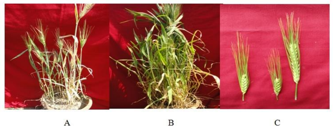
Plate-2 A: Control Plant, B: High Yielding Bushy Plant (0.03% MMS), C: Spike Length (Control, 0.04% MMS, 0.02% MMS)