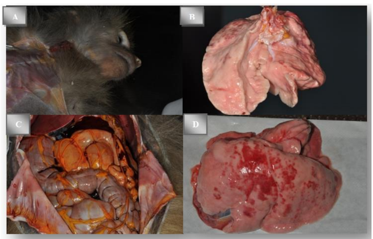
Fig. 2: Two of the three experimental baboons infected by B. coli , after anesthetized with receiving an over dose of ketamine and xylazine. ( A , B ) A large part of the right upper lobe of the lung of 1^{st} baboon was necrotic and infected producing an abscess; the reminder of the lobe was affected pneumonia. The responsible organisms were B. coli trophozoites. ( C , D ) lungs of the 2^{nd} baboons showed pulmonary hemorrhagic, inflammatory mass in the lung was thought to be likely secondary to colonic balantidiasis.