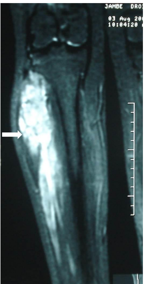
Fig-1: T2-weighted frontal MRI image showing a heterogeneous and hyper intense tumoral process occupying the upper third of the right leg.

absence of cytoplasmic filaments [1]. It is rather easy to confuse ESS with embrionary neuroblastoma, lymphoma or rhabdomyosarcoma. This is due to the fact that EES shares the histopathologic and immunohistochemistry findings with Ewing's sarcoma. Confirmation of the diagnosis should be based on positive staining for CD99 during immunohistochemistry [8].