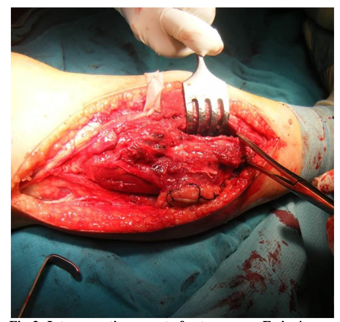
Fig-3: Intraoperative aspect of extraosseous Ewing's sarcoma of the right leg.