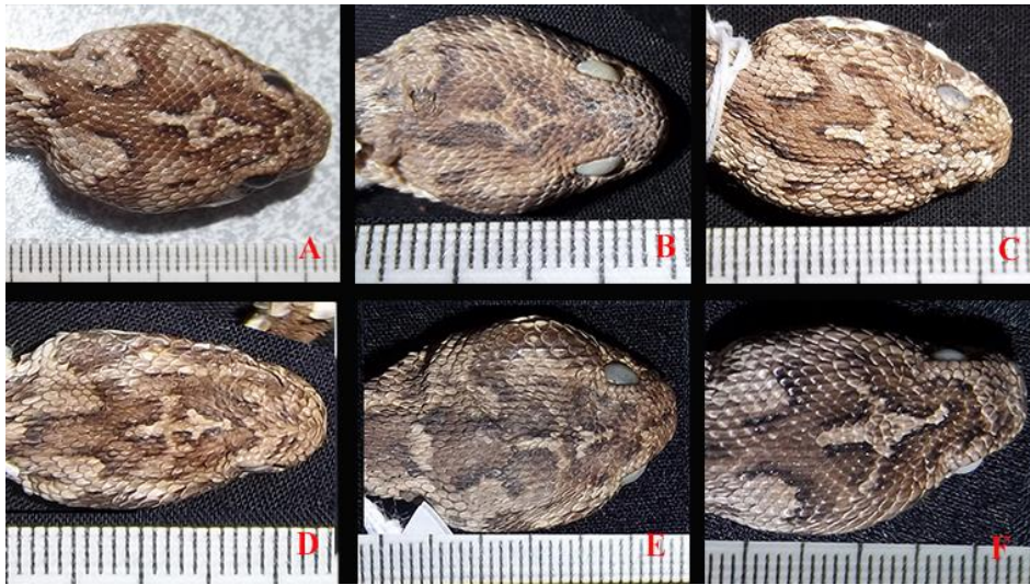
Fig. 3: Head pattern categories. (A-B) a modification of the wide arrow type; (C-F) a modification of the cross and narrow cross.