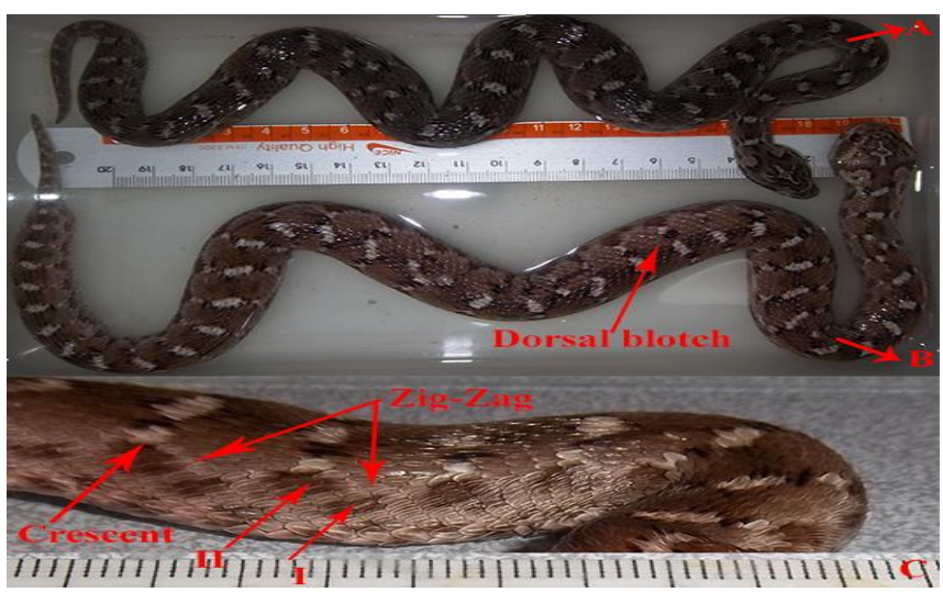
Fig. 4. Dorsal body color pattern. (A) Typical pattern, the density and distribution of melanin in the dorsal blotches most intense; (B) Typical pattern, the density and distribution of melanin in the dorsal blotches least intense; (C) color pattern elements on lateral body surface of Echis