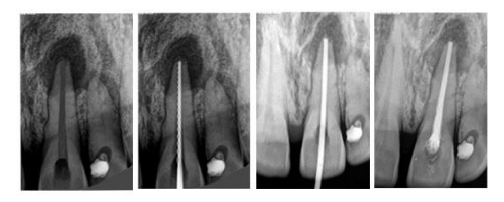
(a)(b)(c)(d)Pre-operativeWorking lengthMaster coneObturationFig-1: Root canal treatment i.r.t 21(Case Report-1)

Patient was recalled on every two month for routine check-up complete healing of the lesion showing after 4 month [Figure 5(e)].