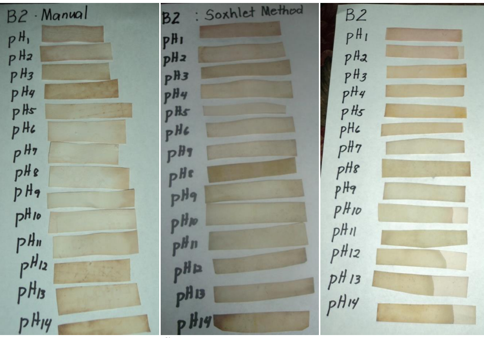
Manual MethodSoxhlet Method RotaryEvaporator MethodFig-2: Color reaction of Latundan (Manila)Bract Extract Paper Strips processed by the three (3) methods with<br/>solutions of varying pH.

colors exhibited in pH 1 to pH 4. This is supported by the study conducted by Castillo et.al.; [2] that anthocyanin is a better acid indicator.