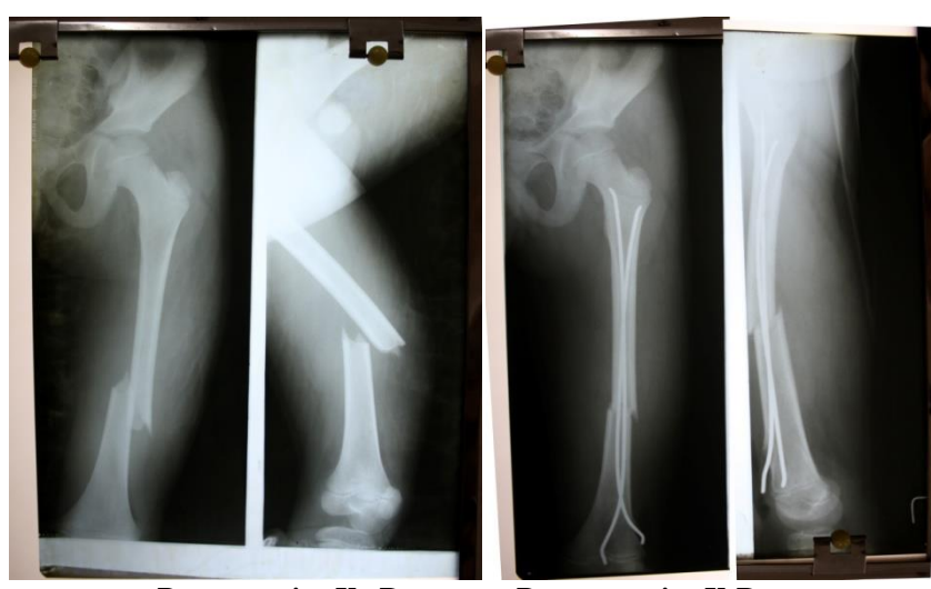
Pre operative X -Ray