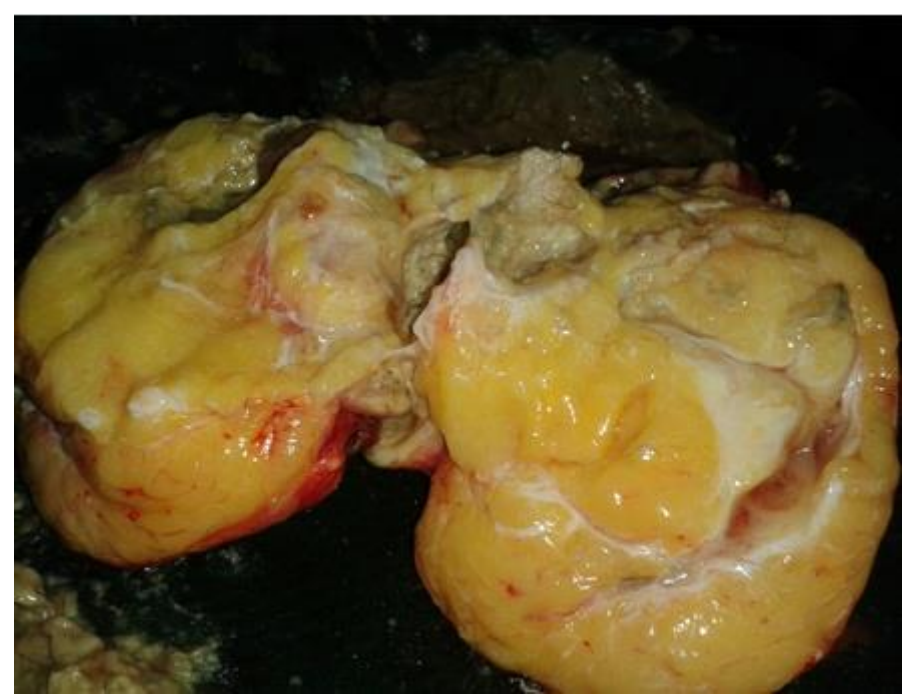
Fig-2: Grossly, cut-section of the resected mass revealed multilocular cystic spaces, whitish-gray walls, scattered yellowish adipose tissues, mucus secretions, areas of calcifications and hair