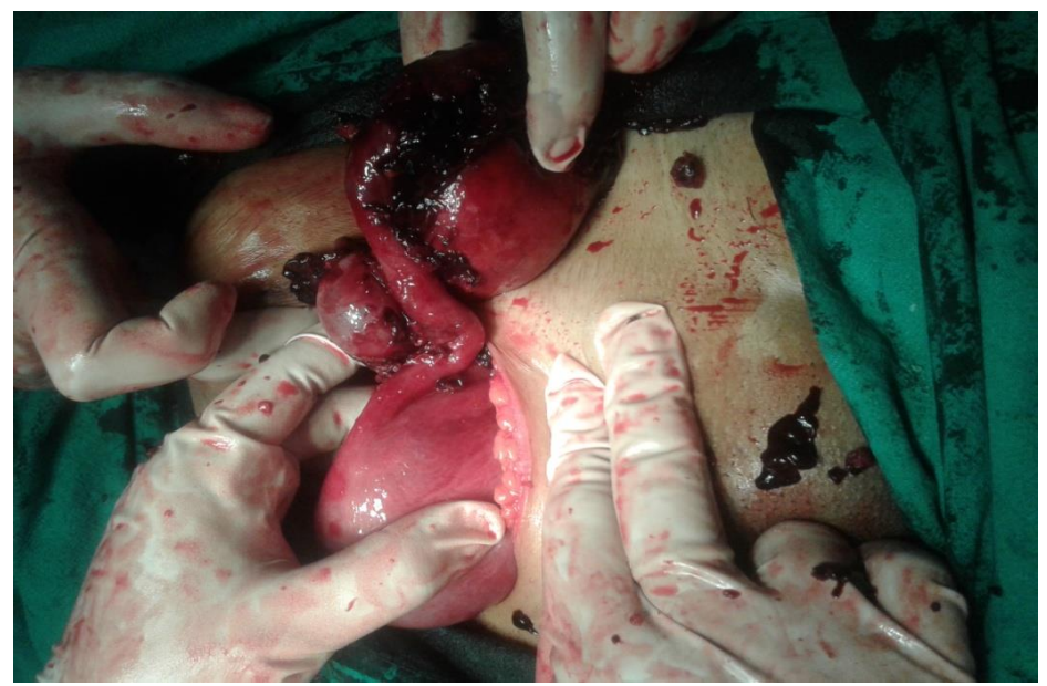
Fig. 2: Gravid Uterus with Left Ectopic Pregnancy