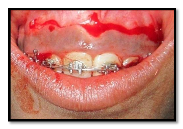
Fig 2: Incision and reflection