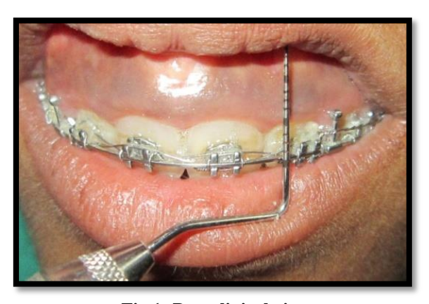
Fig 1: Pre- clinical view

One week following surgery, periodontal pack and sutures were removed. At this time the healing was observed and a second periodontal pack was placed, if necessary. After irrigation with saline, polishing was done with the help of polishing paste and rubber-cup, taking care that it did not traumatized the treated site. Patients were instructed to clean the treated with cotton pellet saturated with 0.12% chlorhexidinegluconate for additional 4-5 weeks in an apico-coronal direction. No mechanical oral hygiene procedures or chewing was allowed for 6 weeks in the treated area. After this period, patients were reinstructed to resume mechanical oral hygiene measures, including careful brushing with soft toothbrush, interdental cleaning with an interdental brush and to discontinue chlorhexidine.