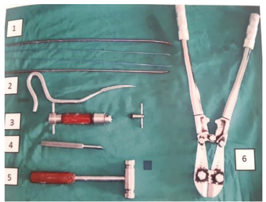
Fig 1: Instrumentation

Patients were treated with antibiotics and analgesics for 48 to 72 hours. Sutures were removed on the 12<sup>th</sup> postoperative day, after periodical wound inspection. Above knee plaster cast was applied after suture removal and retained for a period of 6 weeks. Above knee cast was changed to PTB cast at six weeks and started on partial weight bearing walking with walker, proceeding to full weight bearing by 10<sup>th</sup> week based on clinical and radiological assessment done every four weeks. The outcomes were assessed with Flynn's criteria[8].