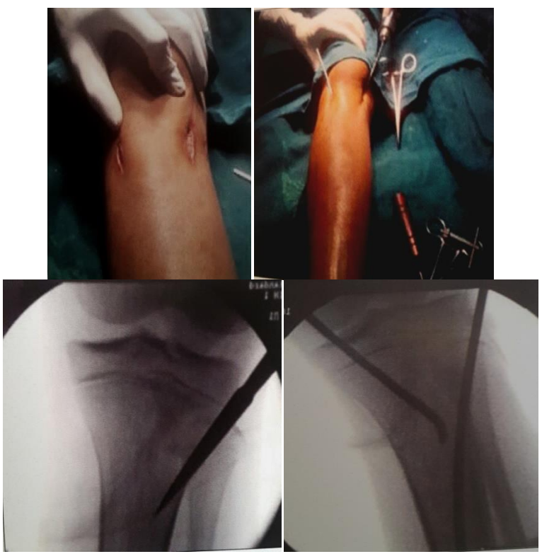
Fig-2: Operative technique