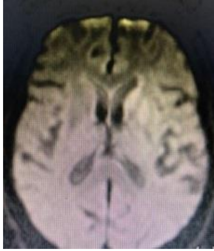
Fig-2: MRI of patient showing signs of infarct was seen in left middle cerebral artery territory and basal ganglia in left hemisphere