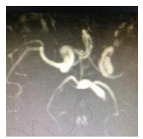
Fig- 3: MRA showing left middle cerebral artery occlusion

Fig-2: MRI of patient showing signs of infarct was seen in left middle cerebral artery territory and basal ganglia in left hemisphere