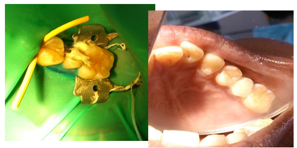
Fig 3: Insertion Of Fibres