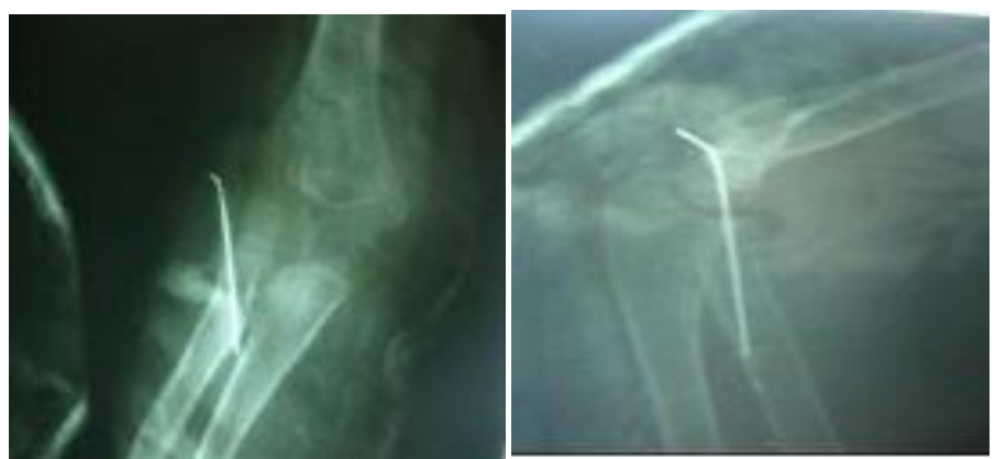
Fig 4: Post op X Ray AP & Lateral images.