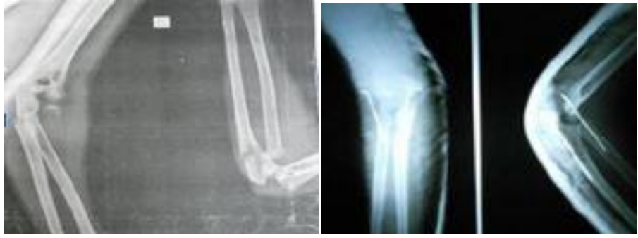
Fig 6: Pre op X ray