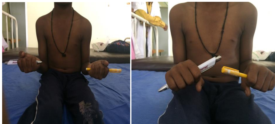
Fig 7: Clinical picture showing poor outcome. Note the limitation of pronation on the right side.