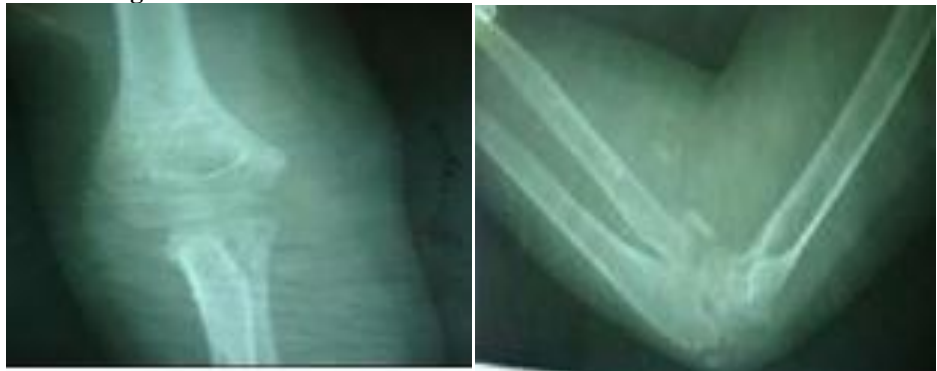
Fig 3: Pre op X Ray AP view and Lateral view