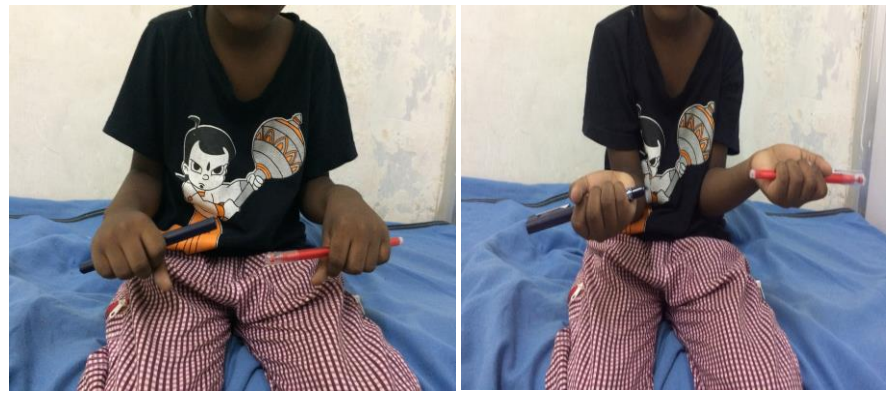
Fig 5: Clinical picture showing good outcome.