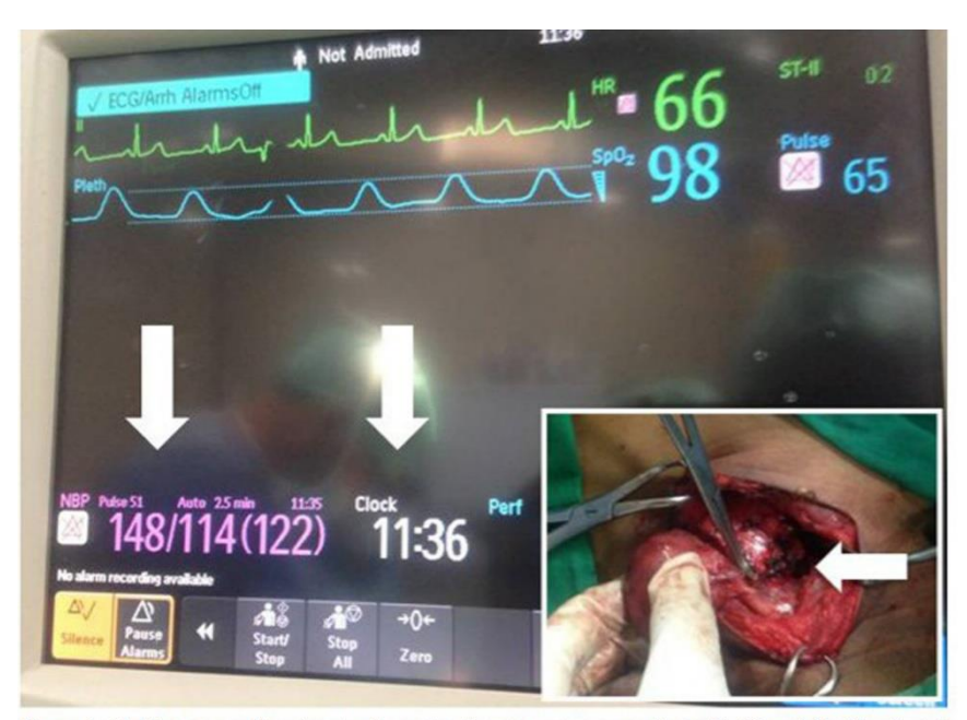
Figure 1: Multi-para monitor showing hypertensive surge corresponding with TG mobilization (Inset) at 11.36 AM [left arrow pointing BP and right arrow pointing TG]

Captured Multi-parameter monitor readings hypertensive, hypotensive and normotensive phases with corresponding operative time are displayed in Figures 1, 2A and 2B respectively. Estuation and recovery were smooth with no signs of strider, hypocalcaemia or features of hyperthermia (Infrared thermometer surface body temperature was 97°F). This hemodynamic response dramatic typical Pheochromocytoma (PH), prompted us to evaluate serum metanephrine level postoperatively, which was normal ruling out PH. At 3 months follow-up, he is asymptomatic on thyroxine replacement.