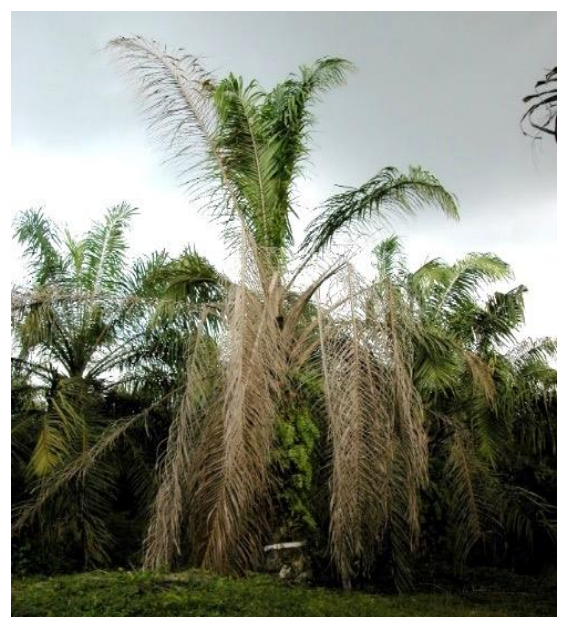
Fig-2: Palm tree reaches by acute fusariosis