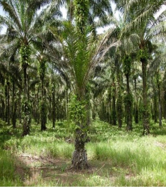
Fig-1: Palm tree reaches by chronic Fusariosis

palms are 9 m apart. The lines and numbers of the trees allow the identification and location of each palm tree.