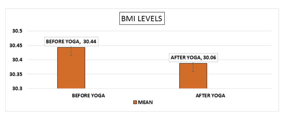
Fig-2: Comparison of mean BMI values before and after yoga

ranging from (1.5 - 4ng/ml) with a significant p value of 0.01(significant as p value is < 0.05).