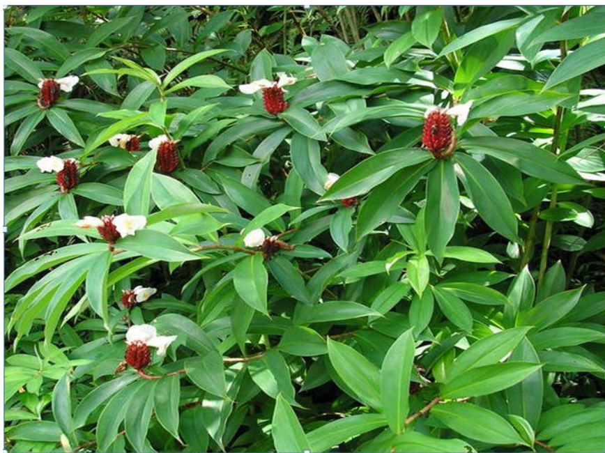
Fig-1: Costus speciosus leaves

Leaves of C. speciosus of rainy season (June – August) were collected from the local market and authenticated by the experts of the department of Botany of the University of North Bengal, Dist. Darjeeling, West Bengal, India. A voucher specimen (No.SM-MB-011) was kept in the department of Medical Biotechnology, Sikkim Manipal Institute of Medical Sciences of the Sikkim Manipal University, Gangtok, Sikkim, India for future references.