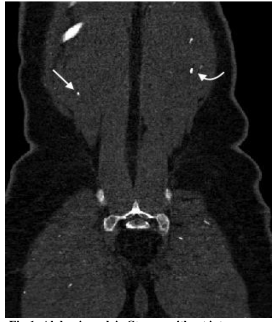
Fig-1: Abdominopelvic Ct-scan without intravenous contrast administration. Oblique- coronal view showing numerous calcifications parallels to muscles fibers giving a "rice grain" (right arrow) or "cigar shaped"(curved arrow) appearance.