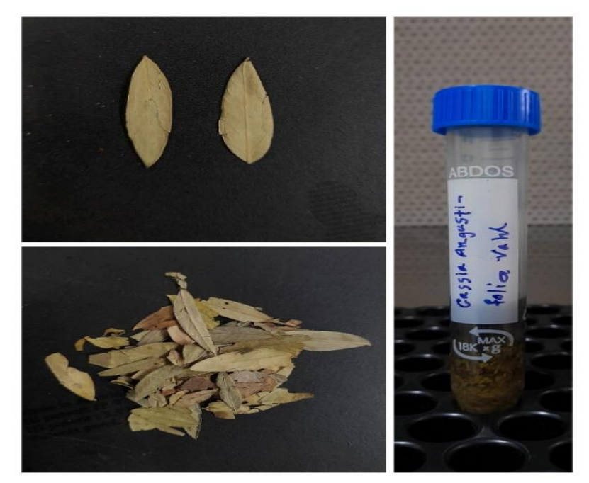
Figure 1: The Leaf of Cassia angustifolia and Ethanolic extract

amount of a-pinene . The dried leaves (Figure 1) were collected in the month of June, 2023. Then the dried leaves were packed separately in polythene bags and brought to the laboratory. The leaves were cut into small pieces by knife. The ethanol extract of the sample were obtained by the following procedure. For extraction 1g of the leaves was kept in 5ml of ethanol for 48hrs at room temperature. After that the extract was separated by centrifugation. The collected samples were centrifuged at 3,000 rpm for 10 minutes.