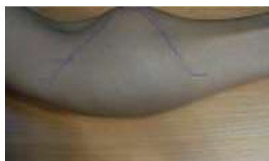
Fig-1: Mass on the volar side of the left forearm

In physical examination a 8 cm × 4 cm non tender, Firm swelling located on the volar side of the proximal third of the left forearm (Figure 1). Mobility restricted in both directions. No cutaneous pigmented lesions were found. There were no concomitant paresthesias or loss of strength in the territory of the median nerve. Percussion over the mass produced Tinel's like sensation along the median nerve.