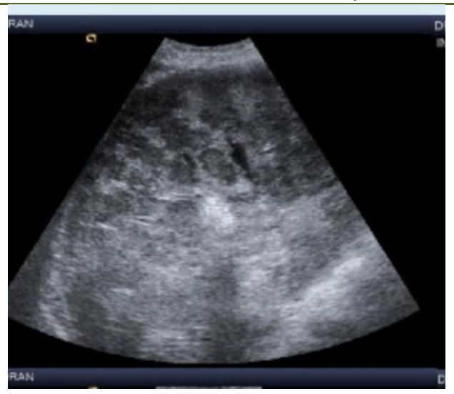
Figure 3: Multinodular liver with metastatic appearance