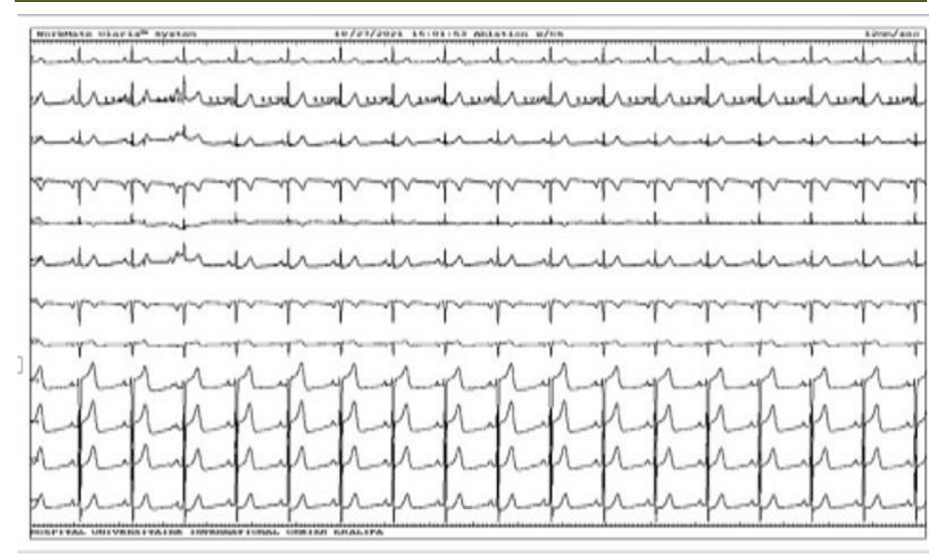
Figure 4: ECG at the end of typical atrial flutter ablation procedure showing return to sinus rhythm