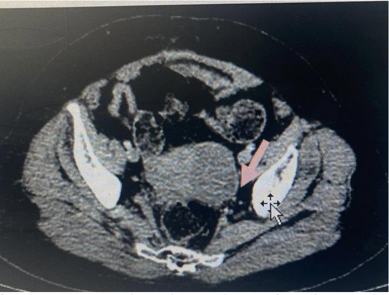
Figure 2: A CT scan of the abdomen and pelvis showing a cystic mass of the left ovary, with no enhancement after contrast injection