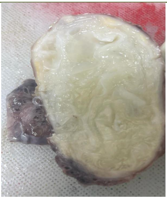
Figure 3: Gross presentation of the specimen showing a well-circumscribed greenish-yellow mass with thick mucinous and gelatinous material