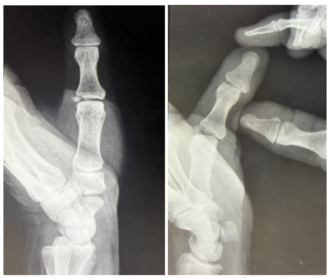
Figure 1: X-ray view of left thumb with a displaced avulsion fracture of the UCL - AP view (left) and dynamic AP view with valgus stress (right)

A 51-year-old male presented at the emergency room with a swollen and painful left thumb after a fall. During clinical evaluation, valgus stress was applied and an unstable metacarpophalangeal joint was noted. Radiological evaluation of the hand revelead a displaced avulsion fracture at the distal attachment of the UCL (Figure 1). Surgical treatment was proposed.