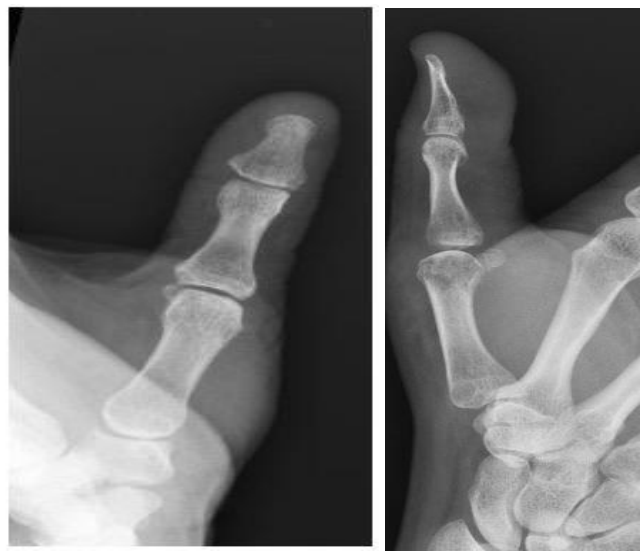
Figure 7: X-ray two years after surgery, AP view (left) and lateral view (right)