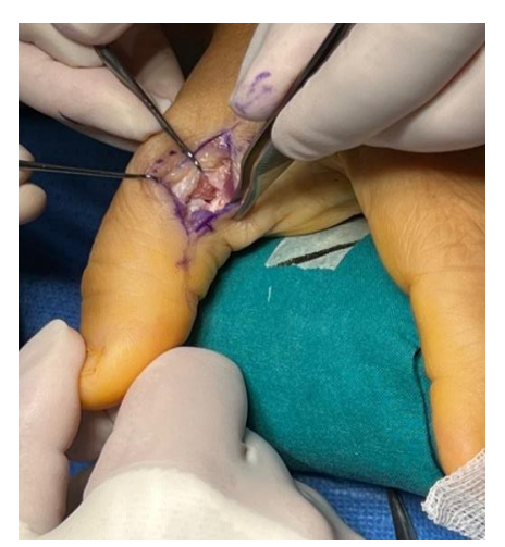
Figure 2: Dorsomedial approach to the MCP of the left thumb

the dorsal cutaneous branches of the radial sensory nerve carefully located and protected. Following this, the aponeurosis of the adductor pollicis muscle was cut, allowing access to inspect the ulnar collateral ligament (UCL). The fracture gap was observed, debris and clots were removed (Figure 2).