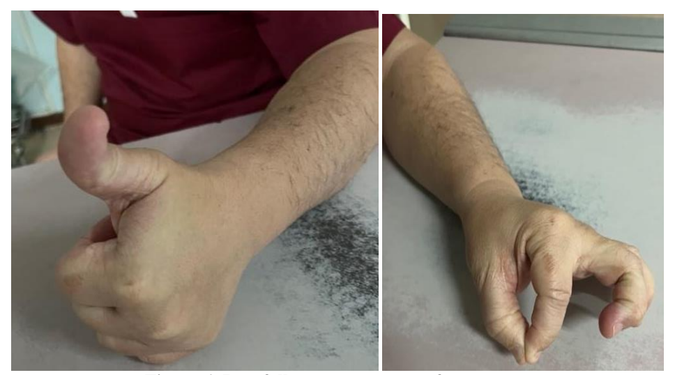
Figure 6: Last follow up, two years after surgery

maintained and 2 years after surgery the patient presented with no pain or instability of thumb metacarpophalangeal joint with a Quick DASH score of 2.3% and a Kapandji thumb score of 9 (Figure 6 and 7).