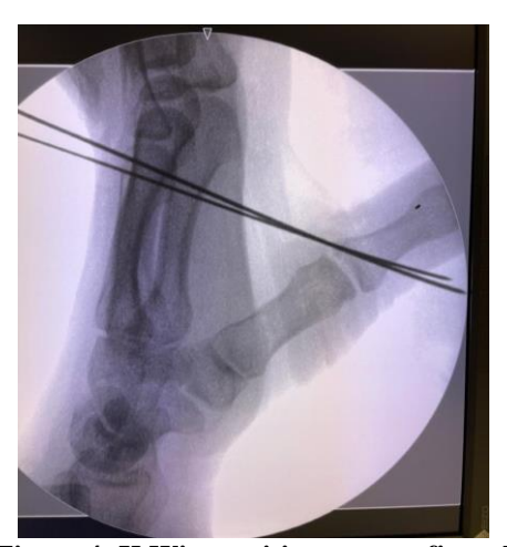
Figure 4: K Wire position was confirmed

A non-absorbable suture ( Fiberwire ) was threaded from proximal to distal using the suture passing K wire. To connect the exit points of the two k wires, a very small radial incision was carefully made. Blunt dissection was performed to allow direct contact of the suture loop with the radial bone cortex. The free ends of