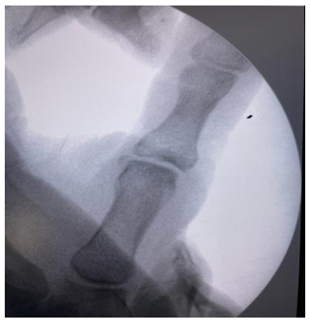
Figure 5: X-rays of the thumb after reattachment of the avulsed fragment

the suture were then pulled and securely tied. The final anatomic reduction and internal fixation of the avulsion fracture was confirmed with fluoroscopy (Figure 5). A valgus stress test was then performed, ensuring the joint stability. The wound was closed.