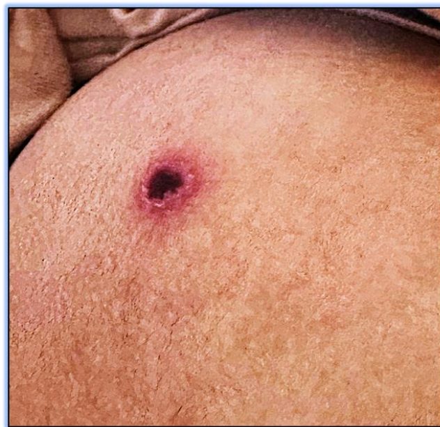
Figure 2: Black spot