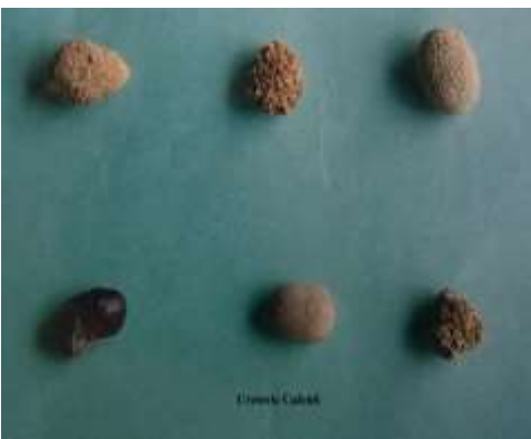
Fig-3: Ureteric Calculi