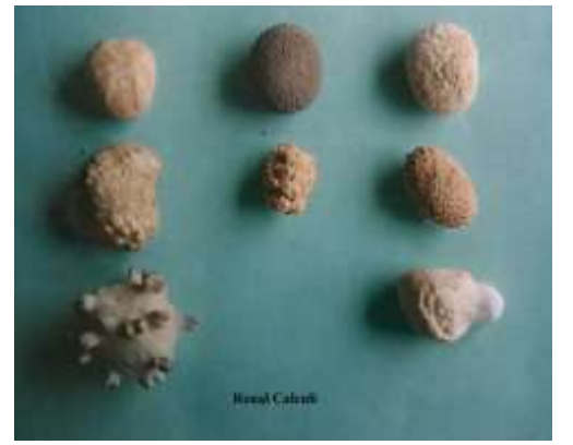
Fig-2: Renal Calculi