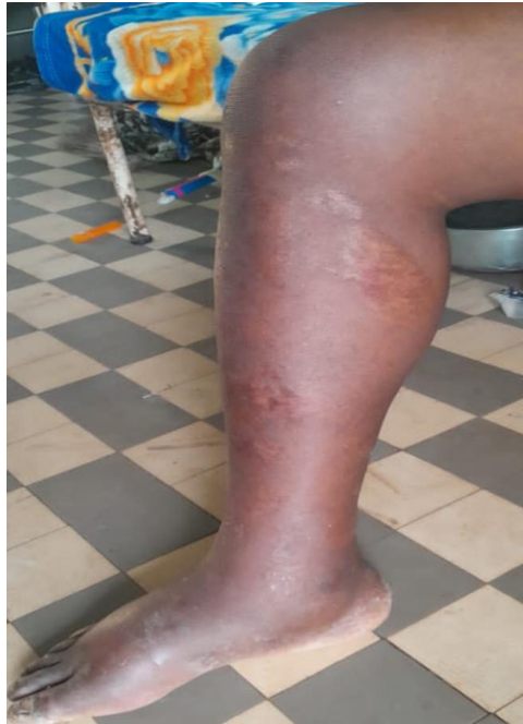
Figure 1: Photograph of a leg and foot showing swelling from venous thrombosis after catheter placement

respiratory distress which had required nursing and oxygen therapy, an acute circulatory failure syndrome (BP = 7 / 50 mmhg) with coldness of the extremities was present. The evolution was unfavorable by death because the patient had succumbed to her embolism within 30 minutes after by cardio-circulatory arrest despite the therapeutic attempts of the resuscitators, the pulmonologists and the cardiologists.