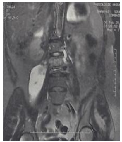
Fig-3: Lumbar MRI showing L2L3 spondylodiscitis associated with psoas abscess.