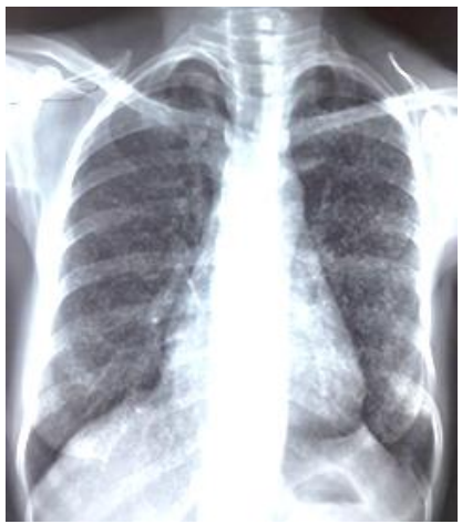
Fig-2: Chest X-ray showing a miliary appearance with rectitude of the left border of the heart related to tuberculous pericarditis