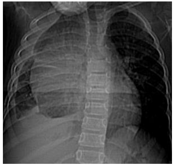
Figure 1: Topogram image (or "scout view") showing a large mass occupying the mediastinum and part of the right lung

markers AFP and BHCG were negative. The patient underwent a total surgical removal of the tumor by thoracotomy. The histological analysis concluded that it was a benign mature teratoma with healthy borders.