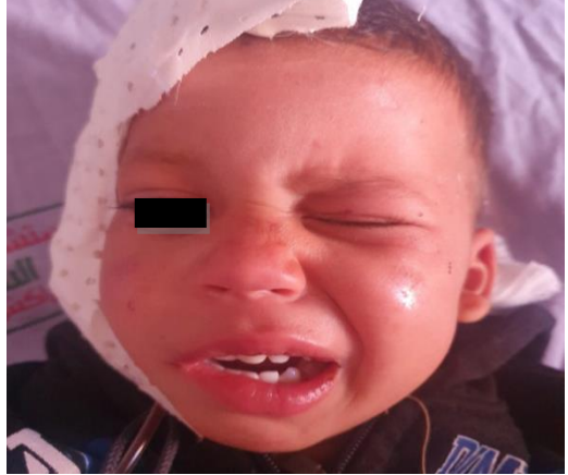
Fig-7: Postoperative images at 48 hours for a slight improvement in facial paralysis

Postoperative follow-up was marked by regression of peripheral facial paralysis turns into grade IV of House and Brackmann upon awakening and persisting after 72 hours of monitoring (Figure 7).