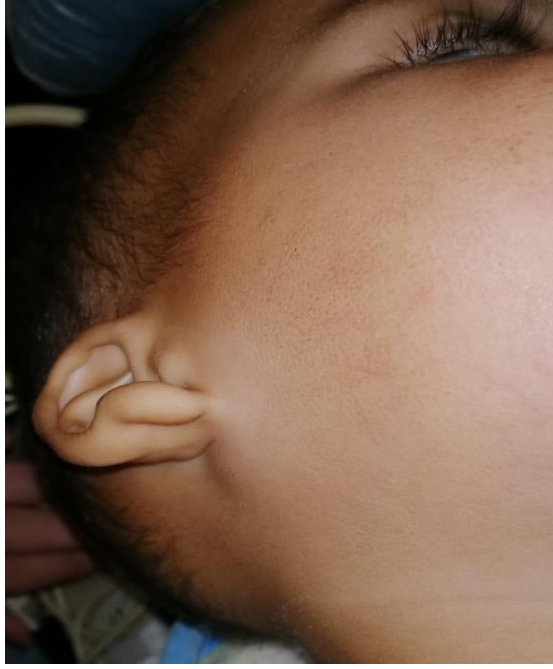
Fig-1: Penetrating pen cap