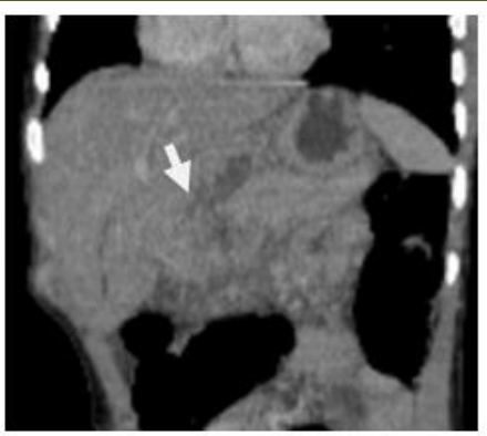
Figure 1: Contrast-enhanced CT scan of abdomen and pelvis demonstrating transection at the junction of the pancreatic neck and body (arrows)