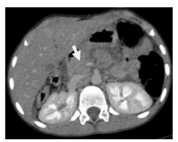
Figure 2: Large amount of high attenuation fluid in the lesser sac and around the pancreas consistent with hemorrhagic reaction (arrows)