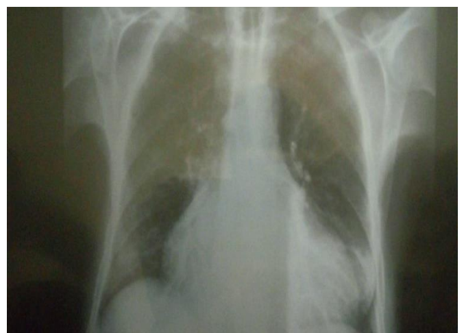
Fig 1: Frontal chest X-ray showing a 70% cardiomegaly with an important right overhang, some bilateral interstitial opacities with hilar overload

Phany Brunelle Issanga Maloumbi et al., SAS J Med, Mar, 2022; 8(3): 167-170