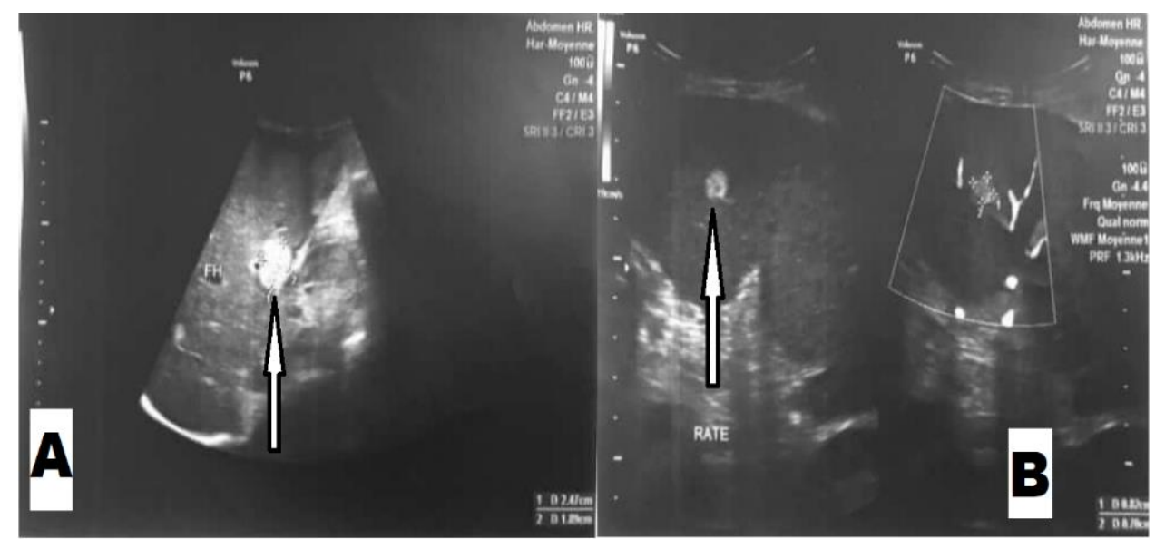
Fig 4: Abdominal ultrasound showing cardiac liver with signs of portal hypertension, two nodules in hepatic segments IV and VI measuring 8 and 29 mm respectively( A), a medio-splenic nodule measuring 8×7mm(B)

Phany Brunelle Issanga Maloumbi et al., SAS J Med, Mar, 2022; 8(3): 167-170