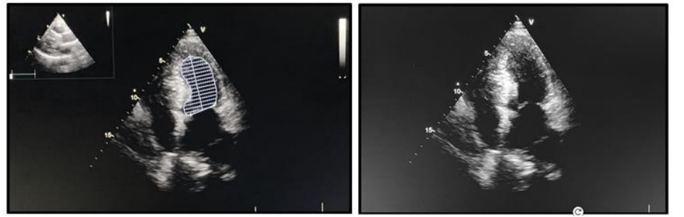
Figure 2: TTE showed a non-dilated, hypertrophied LV with preserved systolic function, LVEF 66%, and preserved segmental and global kinetics

non-dilated atria free of echo, no significant mitroaortic valve disease, a DV with preserved longitudinal systolic function.