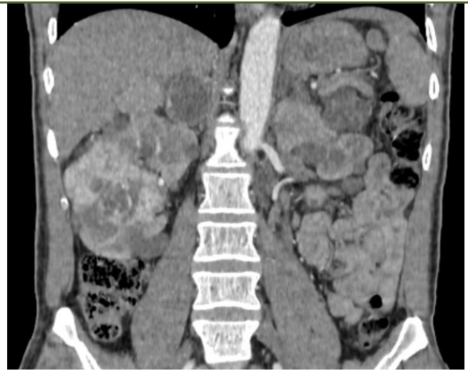
Figure 4: Coronal reconstruction of a contrast-enhanced CT scan: showing pheochromocytoma on the right adrenal gland

The cerebral non enhanced CT scan shows a lesion in the cerebral posterior fossa with destruction of the near bone structure and intralesionnel bone spicules.