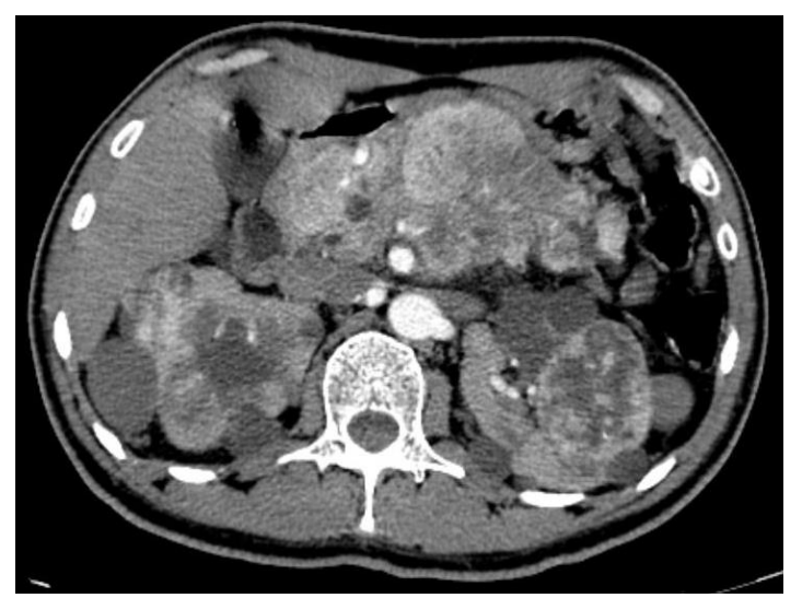
Figure 3: Axial reconstruction of a contrast-enhanced CT scan: showing a mixture of simple cysts and solid enhancing lesions in the kidney and pancreas