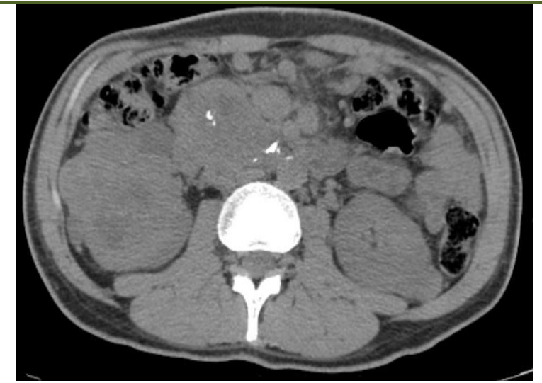
Figure 1: Axial non enhanced CT scan reconstruction; showing swollen pancreas with macrocalcifications