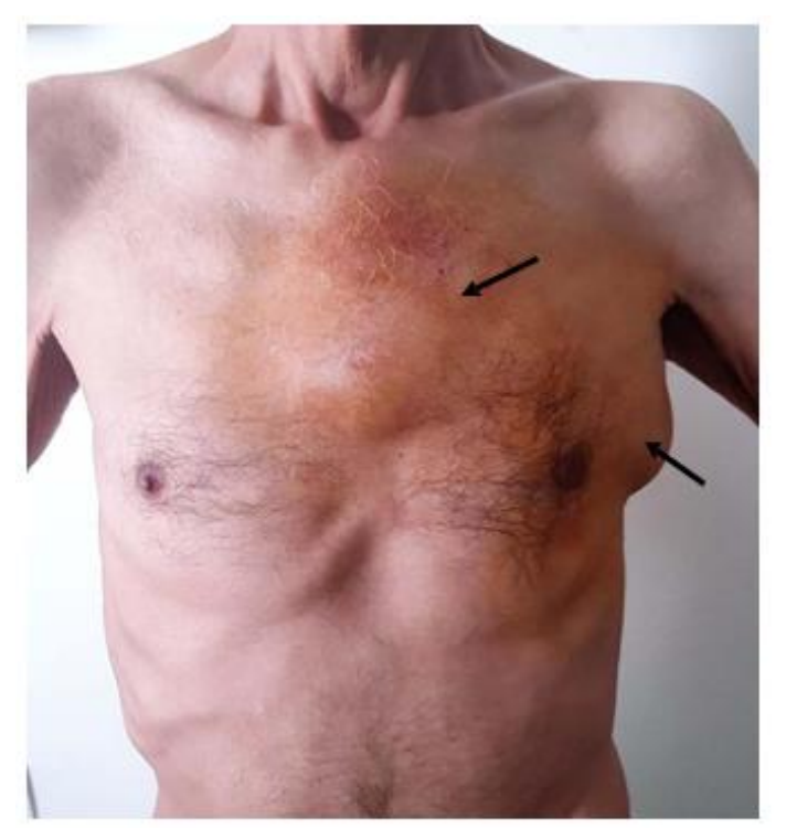
Figure 1: Double thoracic cold abscess, left axillary and parasternal, in a 42-year-old patient