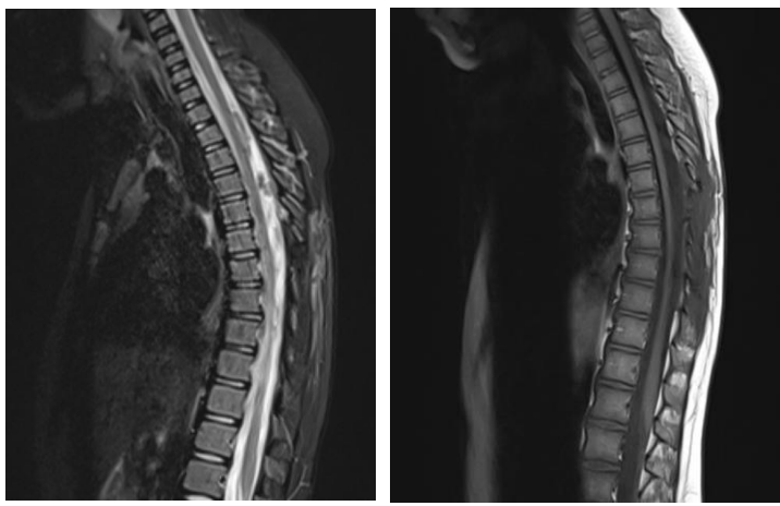
Figure 2: Spinal cord MRI in T1 and T2 sagittal slices showing total regression of the arachnoid cyst with evidence of musculoskeletal changes at the surgical site