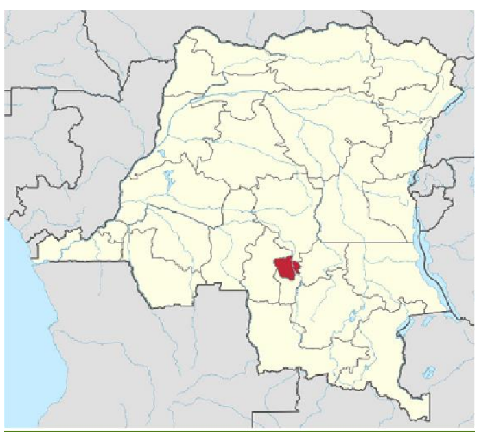
Figure 1: Location of the town of Mbujimayi on the map of the Democratic Republic of Congo (DRC) [11]

Background to the study: This study took place in the town of Mbujimayi, the capital of the province of Kasai Oriental, located in central- eastern DRC (Figure 1). It is subdivided into five communes (Muya, Dibindi, Kanshi, Diulu and Bipemba). It is the third largest city in the country in terms of population. The population is estimated at 2,525,263 in 2021 (Mbujimayi 2021 population data), covering an area of 135.12 km² and corresponding to a population density of 12,441 inhabitants/km² [11].