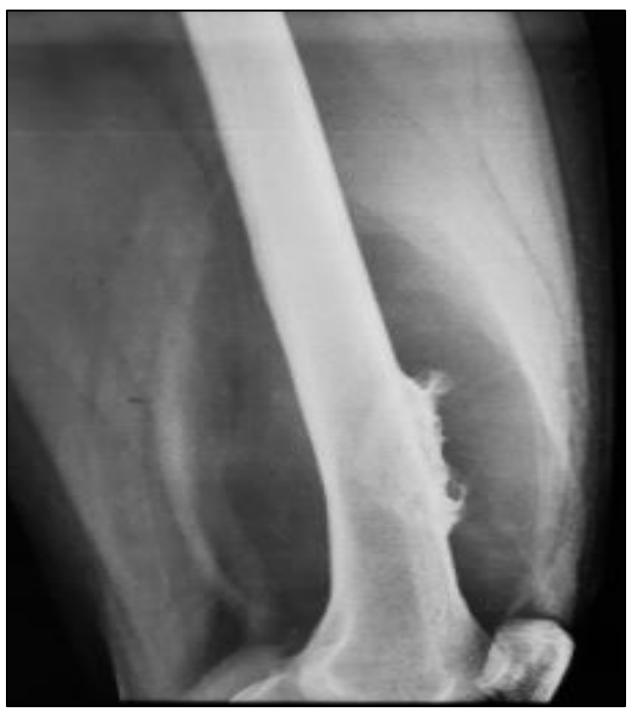
Figure 2: Lateral view X-ray showed a radiolucent soft-tissue mass contiguous to the left distal femur and irregular protrusions of subjacent bone

Radiography of the left leg revealed a juxtacortical radiolucent mass of mid to distal femoral diaphysis, with bony protrusion and adjacent cortical thickening (Figure 2).