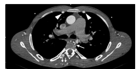
Fig-4: Cardiac multidetector-row computed tomography (axial image) showing a network of collateral circulation involving the internal thoracic arteries (arrowheads), the thoracic cavity wall arteries (double arrows), and a paravertebral collateral circulation (single arrow).