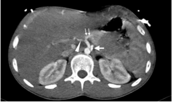
Fig-5: Cardiac multidetector-row computed tomography (axial image) demonstrating an anatomical variation of the coeliac trunk in which the left gastric artery emanates directly from the abdominal aorta (single arrow); proper hepatic artery (arrowhead); splenic artery (double arrow).