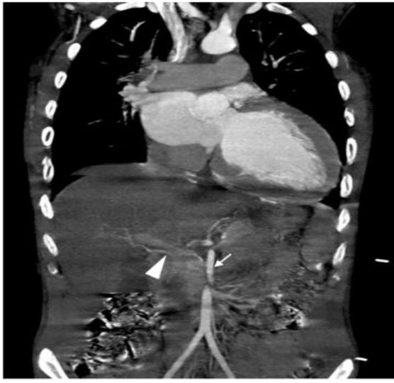
Fig-6: Cardiac multidetector-row computed tomography (coronal image) demonstrating an anatomical variant of the branches of the abdominal aorta consisting of a right hepatic artery (arrow head) emerging directly from the superior mesenteric artery (single arrow).