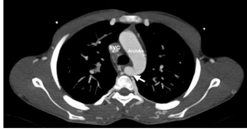
Fig-3: Cardiac multidetector-row computed tomography (axial image) showing an aberrant right subclavian artery (arrow); Aortic arch (ArchAo); Superior Vena Cava (SVC).