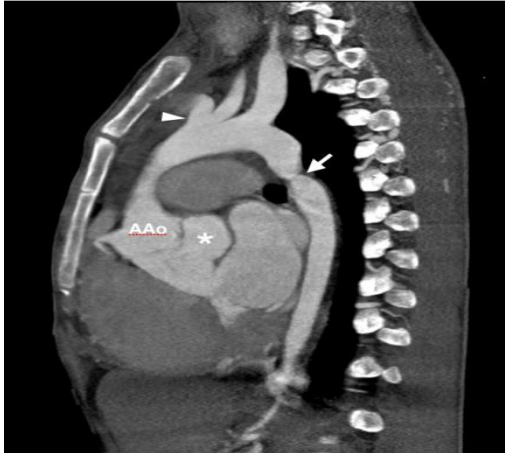
Fig-2: Cardiac multidetector-row computed tomography (sagittal image) showing a truncus bicaroticus (arrowhead); a localized post ductal aortic coarctation (arrow); aortic paravalvular pseudoaneurysm; AAo (ascending aorta).