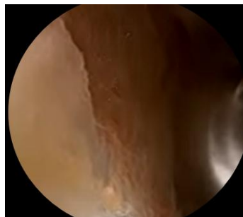
Fig-1: Curettage to stabilize the margins of the defect site

CI, confidence interval, HR, hazard ratio, AOFAS; American Orthopaedic and Ankle Society