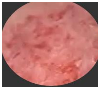
Fig-3: The created microfractures with 3-4 mm intervals