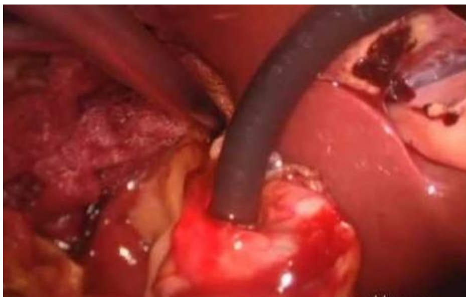
Fig-2: Choledocholithotomy T tube drainage common bile duct in laparoscopic cholecystectomy